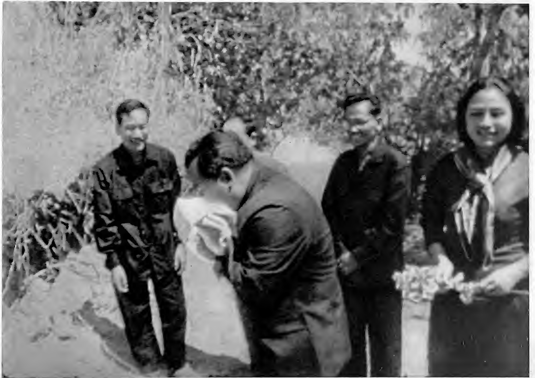
Samdech Sihanouk kissing the earth of his motherland.